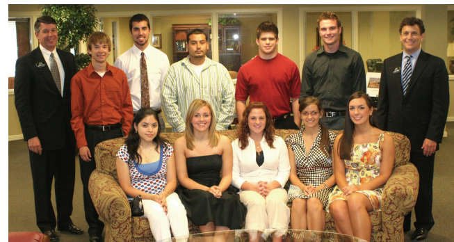
2007 Commitment to Community Scholarship winners, 10 of 25 shown in picture